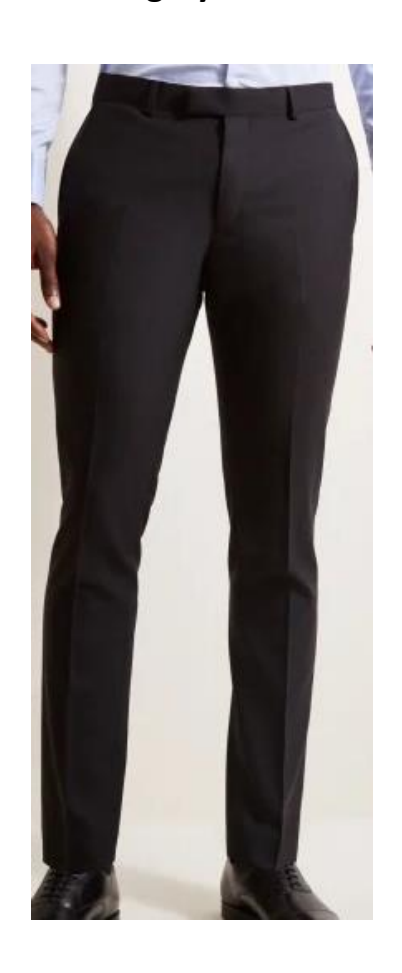
Black or grey trousers